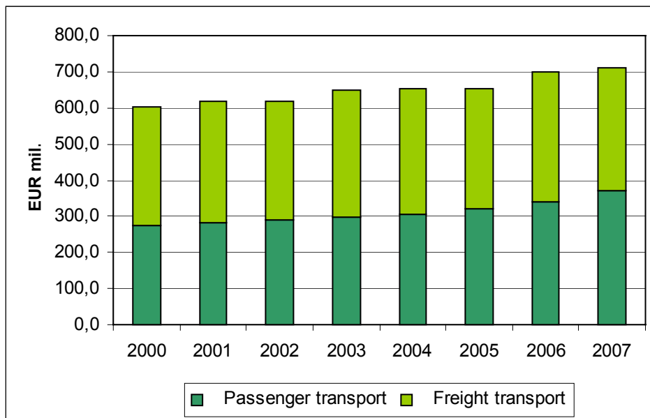
Figure 1: Turnover of VR in passenger and freight rail transport 2000-2007 (Source: Transport and Communications Statistical Yearbook for Finland 2008, VR-Group Ltd.)

In freight rail transportation the dominant enterprise operates mainly as freight carrier in forest, metal and chemical industries in domestic and international traffic. It carries raw materials to factories and finished products to ports and target markets. A high proportion of carryings are to and from Russia. About half of the enterprise's turnover is comprised of freight rail transport and the other half of passenger transportation (see Figure 1). (Annual report 2008. VR Ltd).